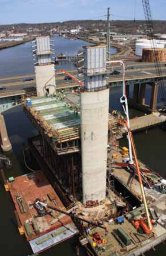
Concrete was placed for the deck of the pier tables from pump trucks stationed on the temporary access trestle below.

parallel to each other in a “harp” pattern. The stays anchor in pairs to the edge beams of the cast-in-place concrete segments and to the steel anchor boxes within the tower legs.