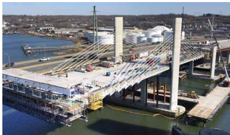
The new northbound extradosed cable-stayed, main-span bridge crosses the Quinnipiac River directly adjacent to the existing Q-Bridge.

Stay-cable strand installation was performed using the elongation method to control variations in individual strand force, and then stressed to 60% maximum ultimate tensile strength (MUTS) from within the tower anchor boxes using monostrand jacks. The 60% MUTS limit for the cable strands is higher for the extradosed bridge design than in conventional cable-stayed bridges, which utilize an upper stress limit of 45% MUTS. Because of