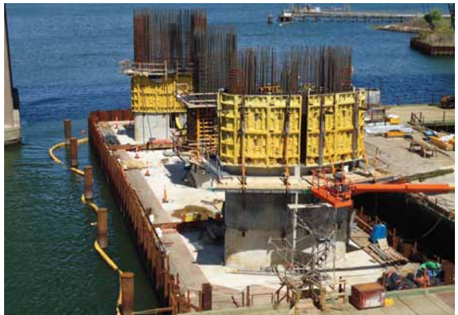
Tower leg jump-form systems were sprayed with insulating foam to control thermal gradients during mass concrete curing.