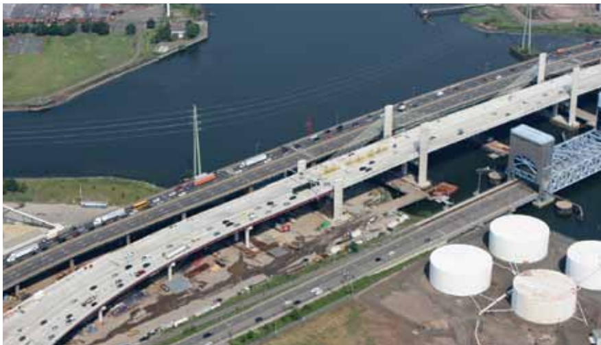
I-95 northbound traffic traveling over the extradosed cable-stayed main-span bridge, one week after opening.

For the New Haven Harbor crossing, the extradosed bridge design allowed for increasing the main span to improve navigation and minimize environmental impacts. The limited tower heights afforded by the extradosed design avoids impacting air traffic from Tweed-New Haven airport located east of the bridge, whereas the taller towers of a traditional cable-stay bridge would have likely infringed on FAA-required flight path clearances. The design was completed with bid packages prepared for two alternatives for the main span; a three-span concrete extradosed prestressed alternative, and steel composite extradosed alternative.